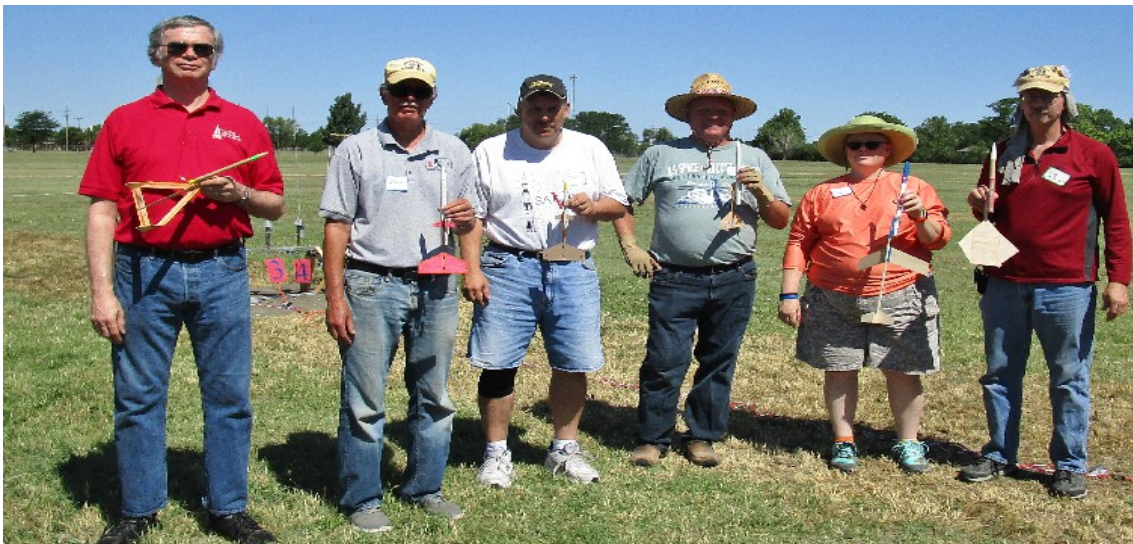
Illustration 1: KRAMO 38 brought out a wide variety of 1/2A Boost gliders, some of which are pictured here.