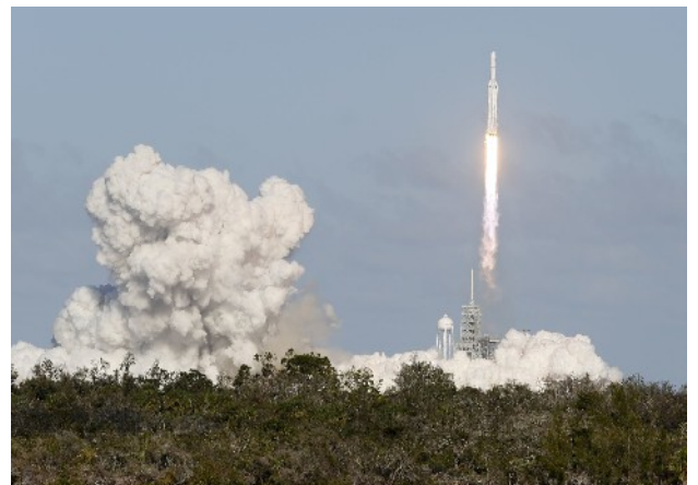
Illustration 1: The actual Falcon Heavy on its maiden flight !

Long time reader of “The KOSMONaut” Joe Peklicz of Martins Ferry, Oh. built this Falcon Heavy four years ago from scratch. Great job Joe ! We agree, it's good to see big rockets flying again !!