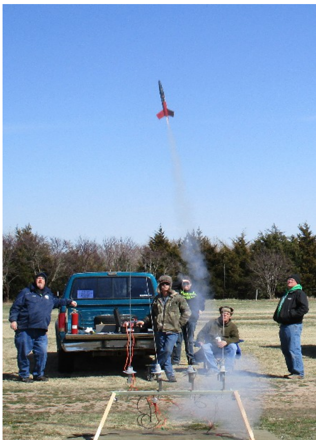
Illustration 4: Old school rocketry ! Fun !!