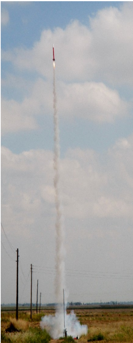
Illustration 3: John's "Club Rocket 2017" on a G67