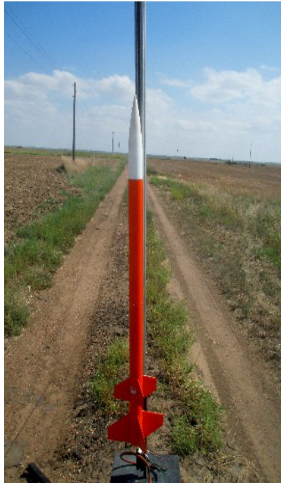
Illustration 1: Duane's Crossfire 2X loaded with a F15 to D12