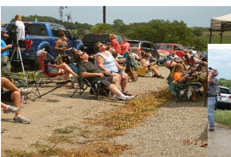
Illustration 1: Road side eclipse viewing