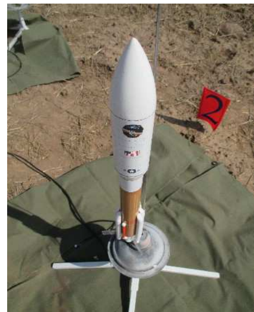
Illustration 6: John Palmer's beautifully finished Atlas 5