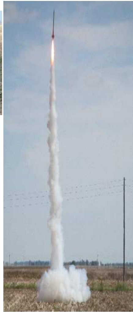
Illustration 3: Steve Saner's "J" powered flight to almost 6900'