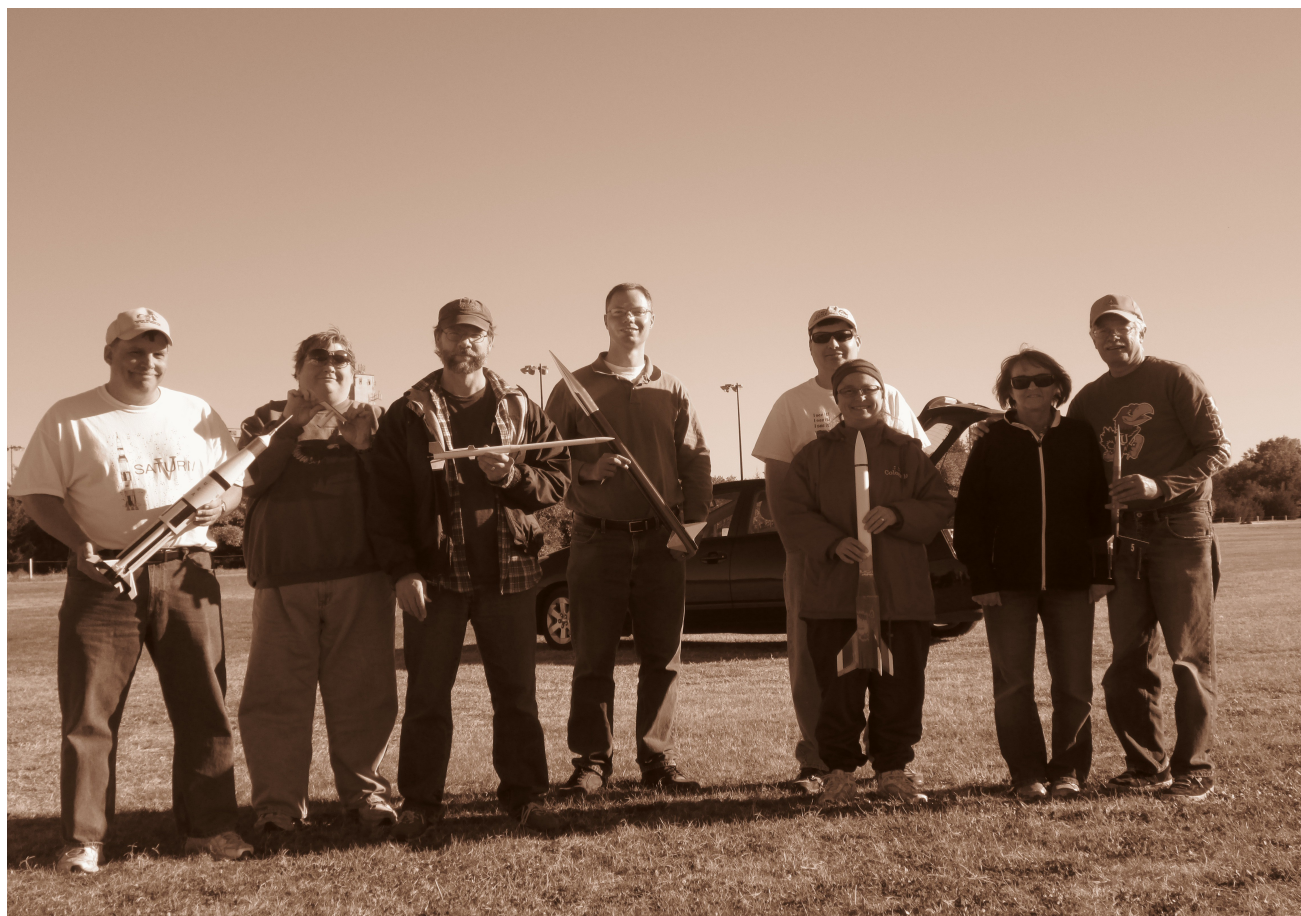
Illustration 1: LOW AND SLOW AT THE FAIRGROUNDS