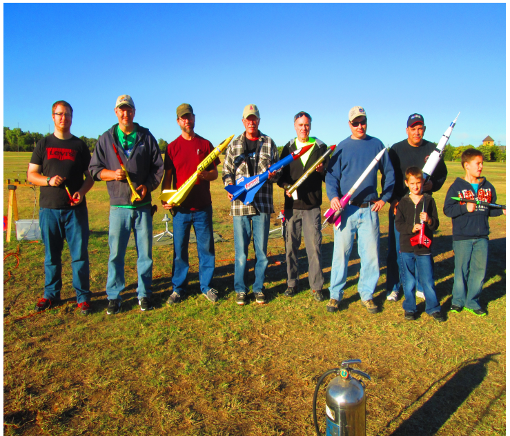
Illustration 3: NIGHTFLIGHT CREW