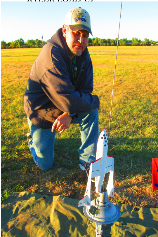
Illustration 5: EVAN BECKMAN AND SPACESHIP ONE