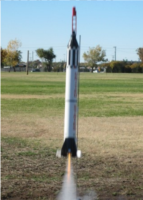
Illustration 8: JOHN'S MERCURY REDSTONE