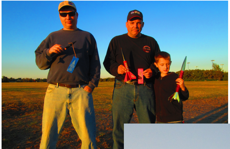
Illustration 4: DRAG RACE WINNERS