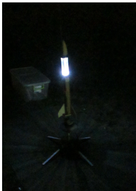
Illustration 7: STEVE SANER'S NIGHT ROCKET