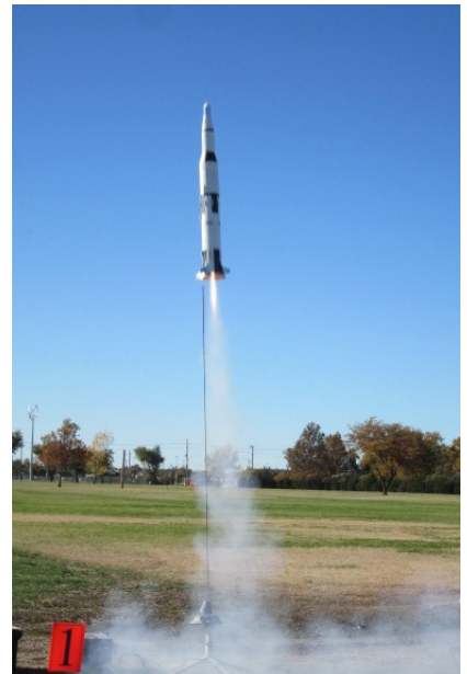
Illustration 11: YUP, JOHN'S AGAIN, THIS TIME A SATURN