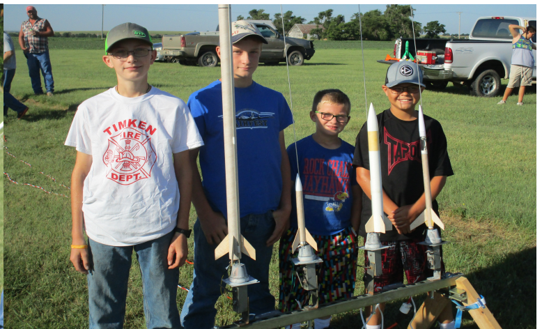
Illustration 4: Picture taken, they are ready to launch !